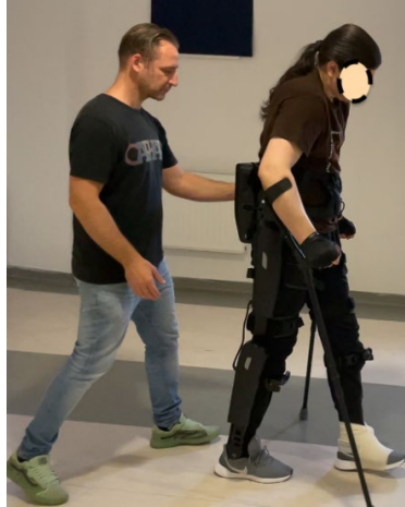
Figure 2 K.Á. exoskeleton gait training