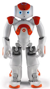
Figure 1 NAO robot

Despite these challenges, the NAO robot has the potential to revolutionize the way that students learn and engage with technology. With further research and development, it is possible that many of these challenges can be overcome, making NAO robot a valuable tool for educators in the years to come.