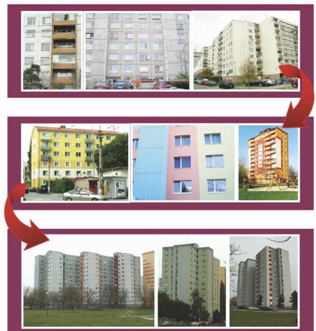
Figure 2. The „Spiral” of colour preferences in architectural environments in Slovakia

On the whole, the dynamics of colours on façades of buildings in Slovakia over the past 50 years confirms W. Spillmann's [5, p. 41] concept of alternating chromatic and achromatic periods in human history. However, the duration of the individual periods is gradually getting shorter – the research in Slovakia since 1990 identifies relevant periods 1990–2000, 2000–2010 and after 2010. As this process has not been managed or coordinated in any way, it has been a spontaneous development, and as such it offers invaluable study material. Studies of preferences conducted since 1990 put in evidence a clear rejection of grey colours on façades in the two following decades. Naturally in practice this was demonstrated by the use of predominantly highly chromatic colours, an “explosion”, which had as a consequence (more or less since 2010) a return to the use of mainly achromatic colours on façades combined with a chromatic colour [3, 4]. This development falls into a “spiral” turning from the use of prevailing achromatic colour schemes through a super colourful period back to the prevailing achromatic phase of a higher level. It is a new quality of grey enriched by chromatic colours of higher chromaticness in limited surface extend.