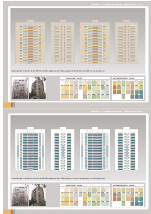
Figure 4. Different variants of colour design for the particular building