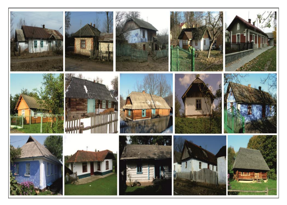
Fig. 1 Samples of rural residential architecture in Halychyna starting with the second half of 19<sup>th</sup> c. till the 50ies of 20<sup>th</sup> c.