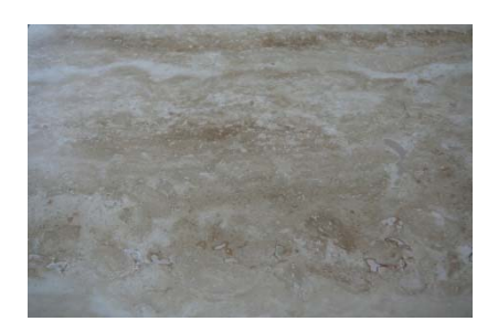
Fig.10 Local smooth stone. Fig.11 Local smooth stone. Fig.12 Local smooth stone.

The objective was to prepare the user for a gradual transition to the next band with the low-relief figures, which emphasizes the material qualities of stone, while at the same time presenting a darker color (Figs. 13-15).