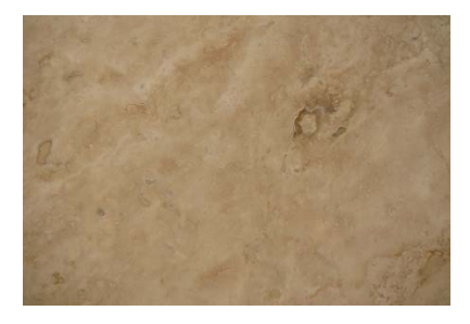
Fig.7 Local brushed stone. Fig.8 Local polished stone. Fig.9 Local polished stone.

In the central part, which is the transition from smaller to larger tessellated stones, smooth stones of light color were used (Figs.10-12).