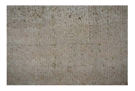
Fig.13 Local chiseled stone. Fig.14 Local chiseled stone. Fig.15 Local sandblasted stone.