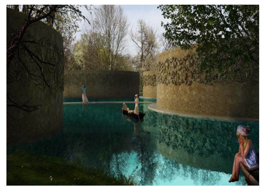
Fig.1 DecoWall in Vàrosliget Park: spiral wall of the thermal bath. Rendering by Nicola Boccadoro.

define the position of the curved walls and of the subterranean compartments, which constitute the thermal baths in the hypogeal level with their various functions (Fig.3).