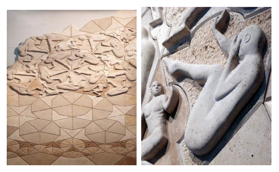
Figs.3-4 Mock-up made by Reneszànsz and displayed at the 46th Marmomacc. Verona 2011.

Furthermore, aluminum-sheet templates were also used both for the definition of the size of raw material to be extracted from the quarry and for the development of various blocks.