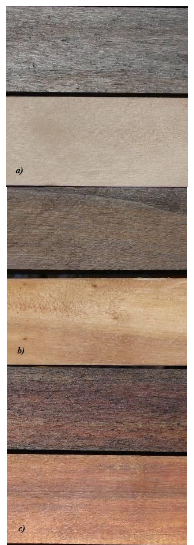
Fig. 3. The colour change of Poplar during outdoor weathering (lower: initial condition, upper. after 12 months exposure) a) Poplar control; b) Poplar 160°C/2h; c) Poplar 200°C/6h