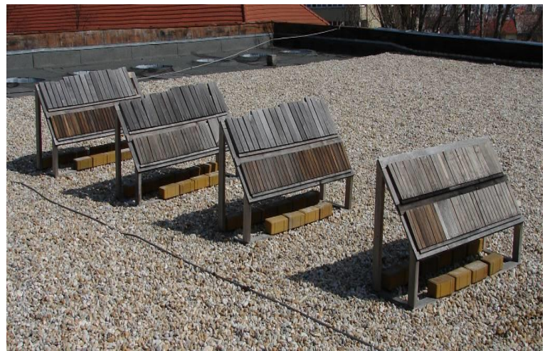
Fig. 1. The samples for outdoor exposure fixed on the stands, faced to the south, inclined by 45°

In our investigations the curve of the colour coordinates versus time were presented, rather than the changes.